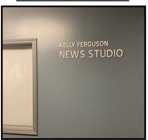
Wells 233 Newsroom