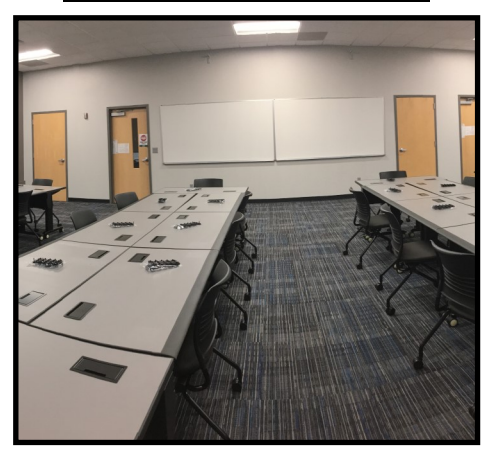
Colden 1350 CSIS Lab