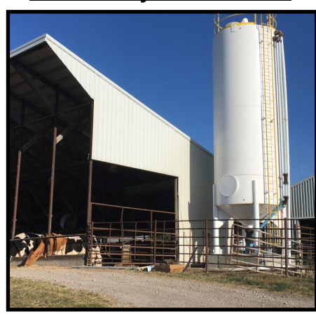
New Dairy Flush Tank