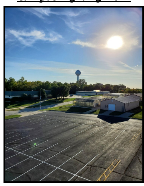
Campus Lighting Work