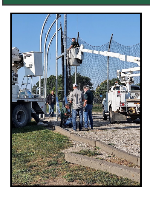
Hammer Cage Repairs